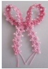
Click for larger picture