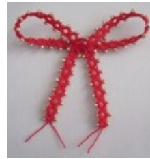
Click for larger picture